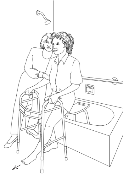
Figure 2. Sitting down