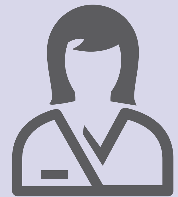
Physician assistant or nurse practitioner