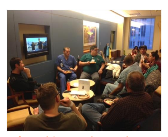
NICU Dads' Networking Night On March 13<sup>th</sup>, the NICU Family Support Committee hosted its first NICU Dads' Networking Night

More pictures of the 2015 NICU Reunion can be found at nicu.nm.org .