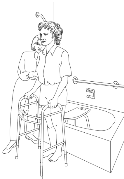
Figure 1. Backs of knees touching the tub