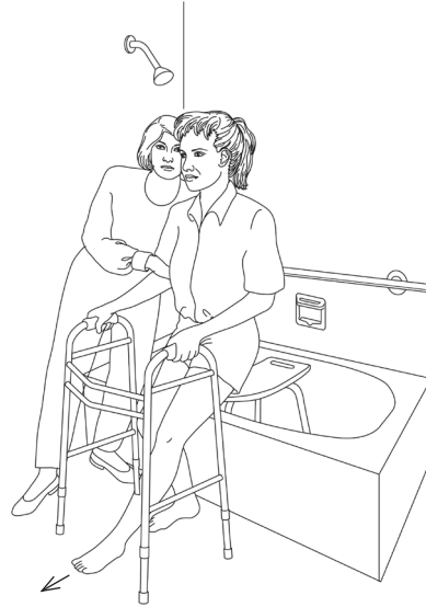
Figure 2. Sitting down